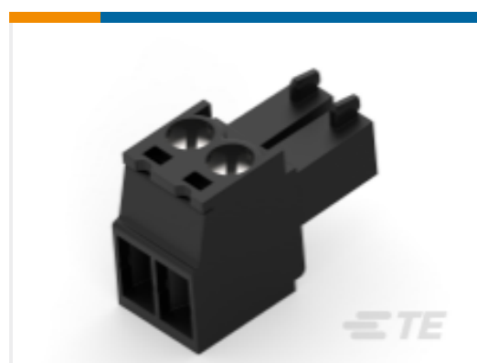
TE Part # 2213936-2 SMT TB SCREW RECEPTACLE, 3.5 MM, 2 POS