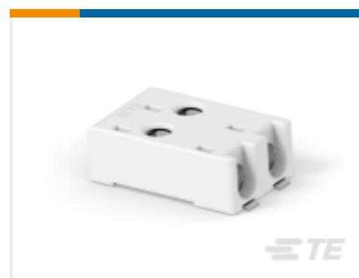
TE Part # 2834385-2 RELEASE POKE-IN CONNECTOR_2P_NATURAL